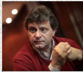
Mayor Gustavo Pulti

separation of waste was an issue on the agenda that was very important to the political party. The phase that began a year ago, was described as a "turn the issue" in the history of organic solid waste in the city. The separation of household waste at source; then this must be put either in green bags form recyclable materials (cardboard, paper, plastic, glass and metal) or black ones for the organics. Each color bags are to be collected on specific days of the week. This is a big step that immediately following the inauguration of the new final waste lot. "